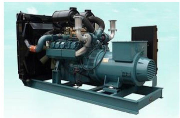
Sound-proof ( KP-DS380-SR )